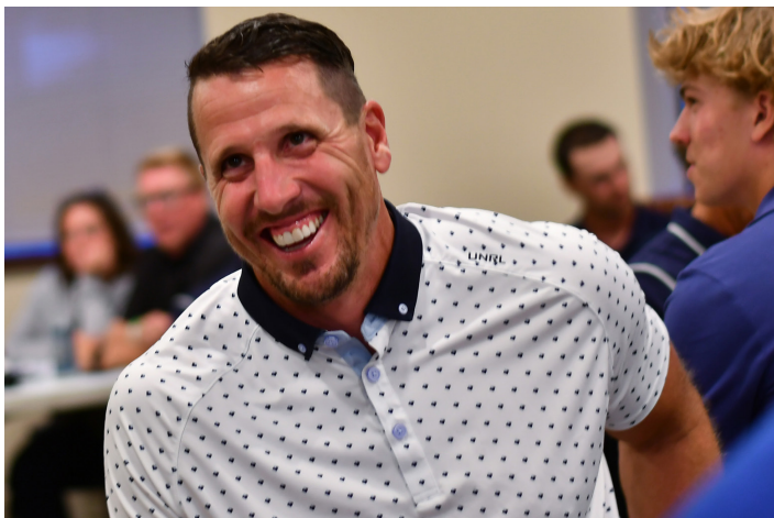
Former Minnesota Vikings all-pro linebacker laughs after speaking at the Div. I State Tournament Banquet on Wednesday at Osseo Post 172. He told about his high school, college and professional lives, and said his high school sports experience was his favorite.

Linebacker says nothing would have been possible without high school teammates