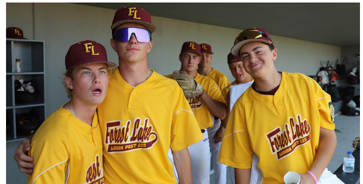
Forest Lake players ham it up in the dugout on Saturday during their 7-4 victory over Fridley Gold at Gleason Fields in Maple Grove. Farmington and Forest Lake today continue a game suspended on Saturday because of lightning.