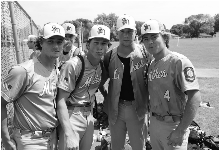
The St. Michael Mikes of Post 567 were in good spirits Friday before their game at Adams Alumni Field against Prior Lake. They won 13-3.