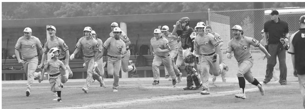
A kid in uniform has a blast leading the Moorhead Blues onto the field on Friday.