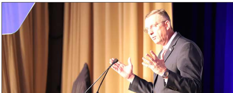
At the Washington Hilton, VA Secretary Doug Collins said there will be no cuts to benefits and health care for veterans.