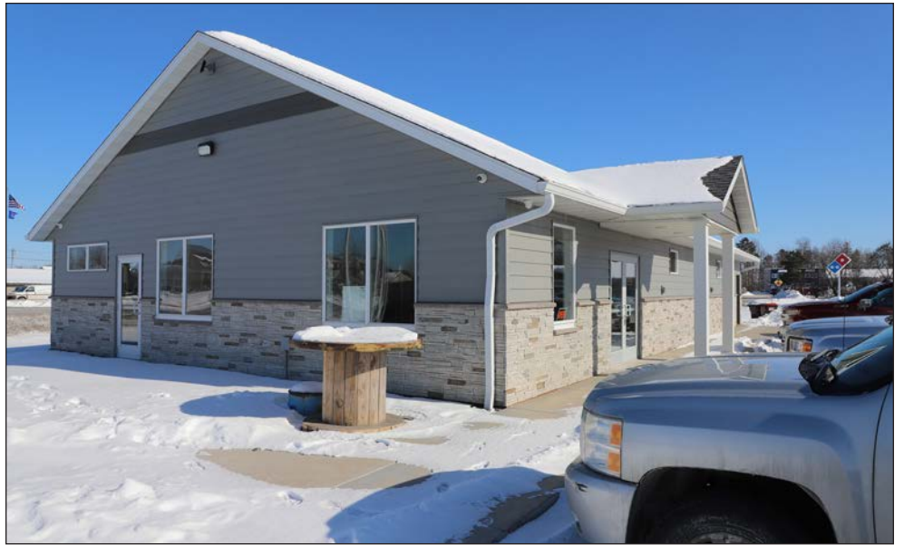
Mora Post 201 has offices, a meeting room and room displaying military and veteran artifacts and memorabilia. The build serves no commercial purpose, yet Kanabec County taxes it like one. The county assessor did not return the Legionnaire’s phone call seeking answers.

Another display shows pages from the Minneapolis Tribune that lists every Minnesotan killed in World War II — by