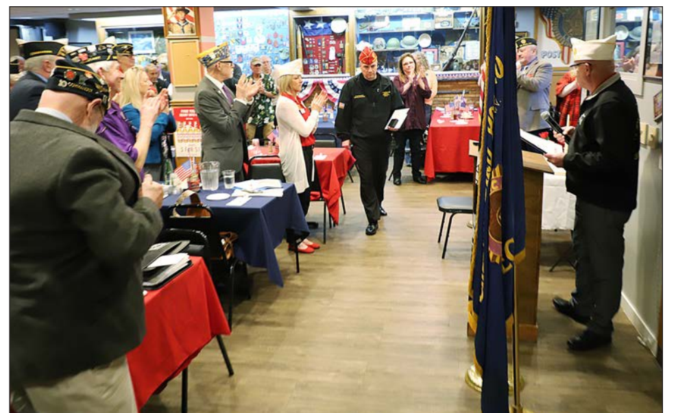
The National Commander’s Tour in April 2024 stopped at Post 523. The national commander at the time, Dan Seehafer of Wisconsin, approaches the podium after then-Department Commander Paul Hassing introduced him.

With the transaction now finalized, American Legion Post 523 will begin remodeling and updating its new facility, which is expected to open in September 2025. In the interim, the post will continue operations at its current location.