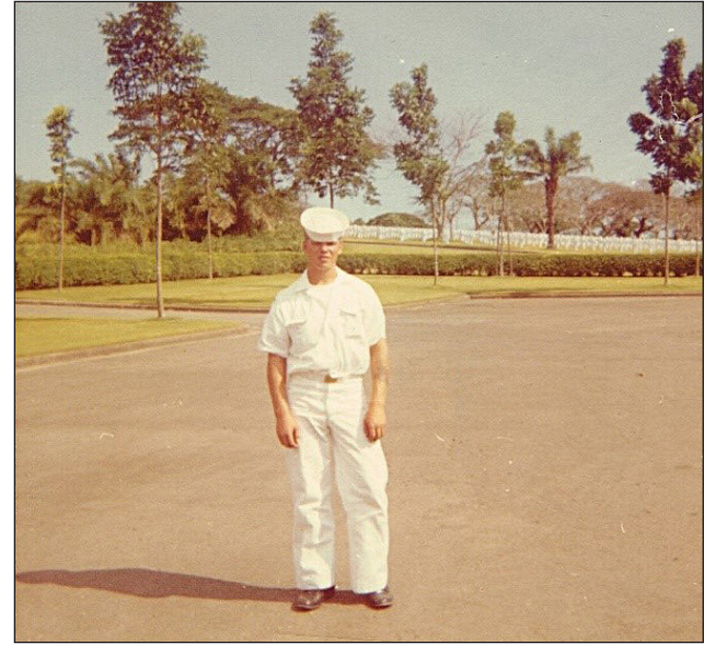
The author visits Manila American Cemetery in July 1966.