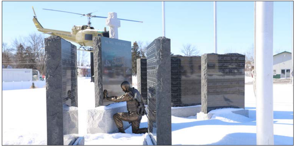
The Kanebec County Veterans Memorial in Mora was dedicated last summer and was joint project of Mora Post 201 and Ogilvie Post 640. It is on land donated to Post 201. The memorial does contain a Christian cross. Courts have determined, time and again, that religious speech is allowed in veterans memorials on public or private land. Faith is what got many veterans through harrowing experiences.

county. An Ogilvie postmaster had saved it.