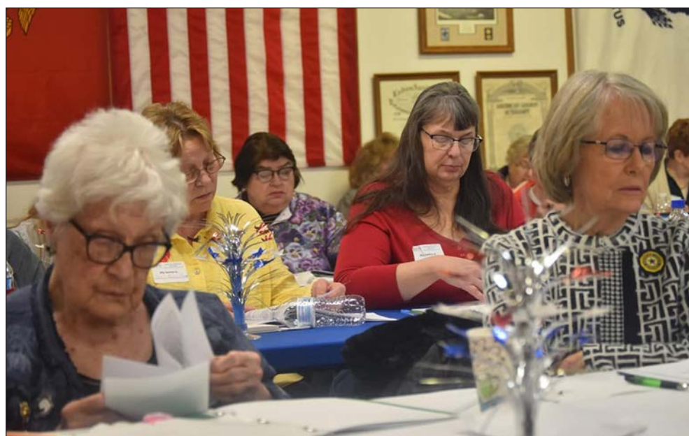
Members listen to presenters during the Leadership Workshop held in Cold Spring.