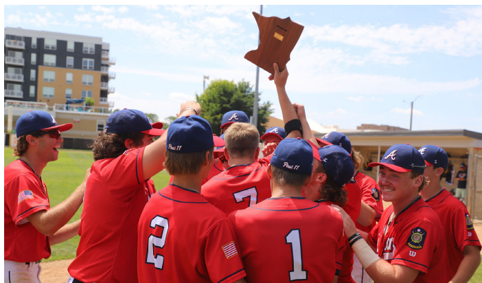
Mankato Post 11 American players celebrate after their victory over Wayzata to capture third in the Div. I State Tournament.

When he saw it leave the park, it was a rush because he knew the game was over.