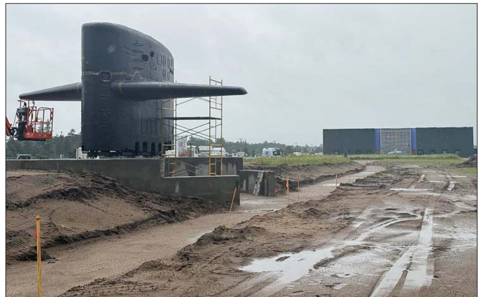
Someone call the National Guard! There is a submarine rising up out of the ground outside the new home of the Minnesota Military & Veterans Museum. Wait! It’s the sail of the USS Minneapolis-St. Paul.