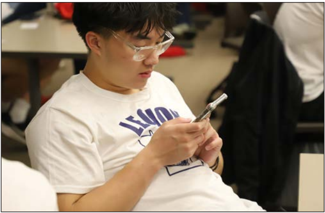
This boy might look like he's on his phone needlessly, but he's actually voting.