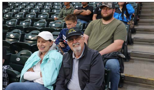
It rained and stormed all day right up until the opening ceremonies. About 75 tickets were sold for The American Legion section, but the rain chased many ticket holders away. Some, however, showed up, and we appreciate them.