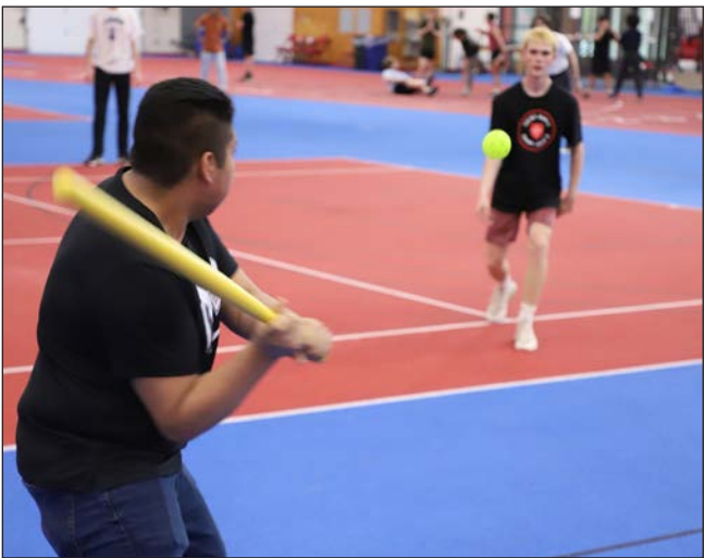
Whiffleball was played indoors because the rain prevented an outdoor game of kickball.