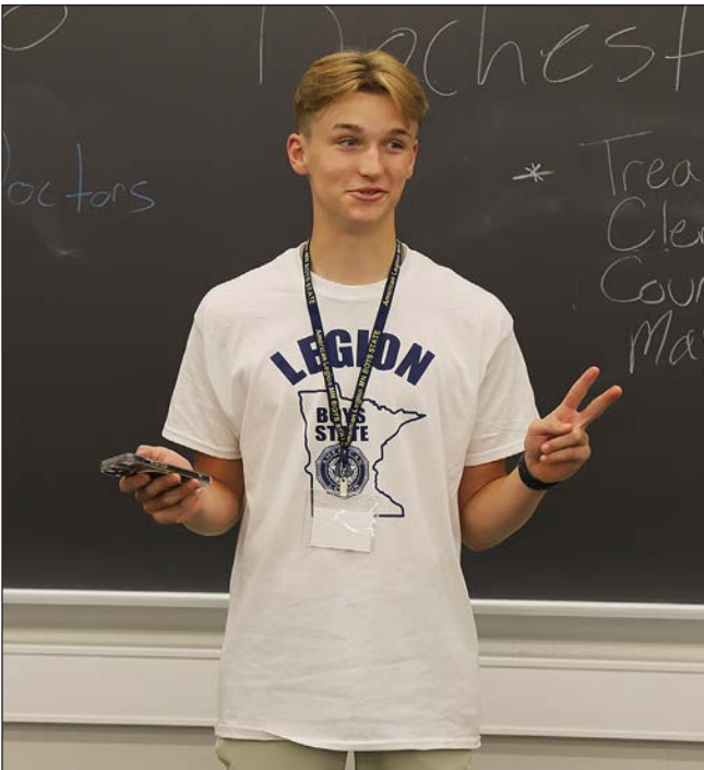
Delegates run for offices with stump speeches.