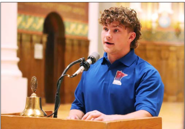
Elected governor in 2024, Tucker Fournier delivers a stirring farewell address about the challenges he faced growing up and the importance of overcoming obstacles in life to accomplish goals.