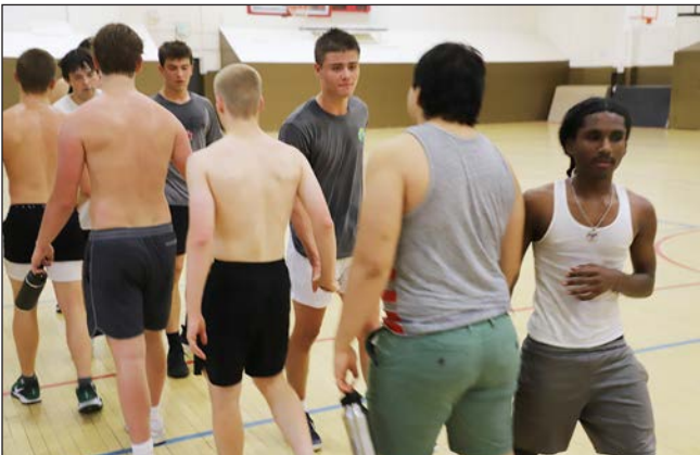
Cities have basketball teams. Here, the champs and runner-ups show their sportsmanship after the game.