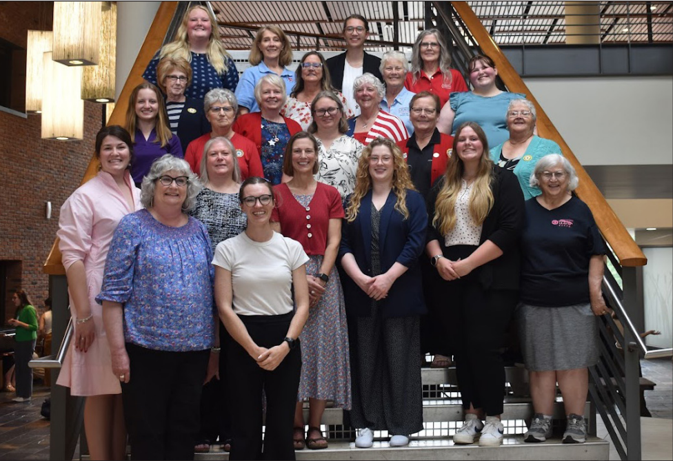
Shown is the staff from the 2025 Minnesota Girls State.