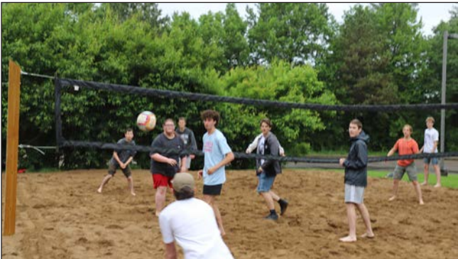
Volleyball was popular among the Boys State delegates.